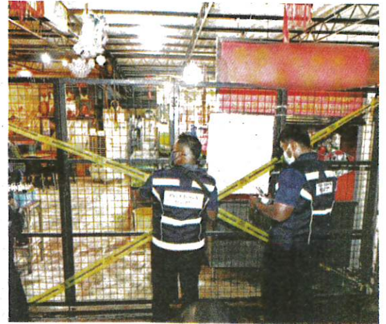
SALAH sebuah premis makanan yang ditutup sementara di George Town pada Khamis lalu.

Katanya, penahanan itu disebabkan lima warga asing terbabit tidak mempunyai dokumen perjalanan dan seorang lagi telah melanggar Akta Imigresen 1959/63 iaitu tinggal melebihi tempoh dibenarkan.